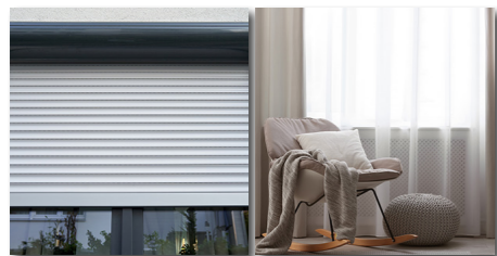
Roller shutter automation

Shelly Pro 2PM supports two-directional motor control, which makes it perfect for automation of roller shutters, curtains, awnings, and gates. Customers can use scripting functionalities to set custom automation scenes based on various occurrences, weather forecast, wind forecast, etc.