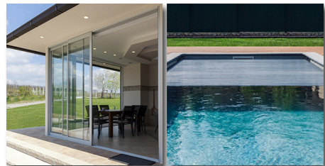
Sliding doors control